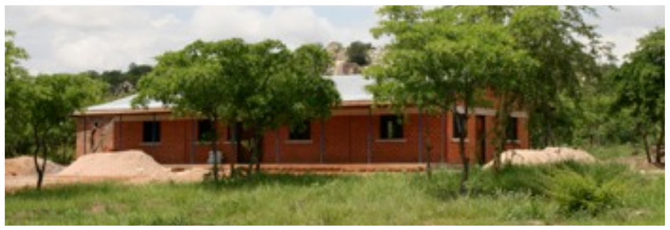
A front view of the main building

6 Be careful for nothing; but in every thing by prayer and supplication with thanksgiving let your requests be made known unto God. 7 And the peace of God, which passeth all understanding, shall keep your hearts and minds through Christ Jesus. Phil 4 v6,7