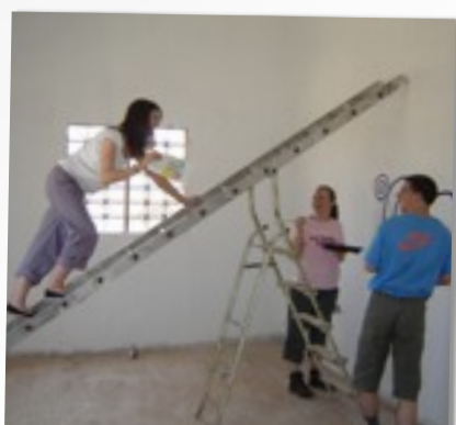
STARTING THE MURALS