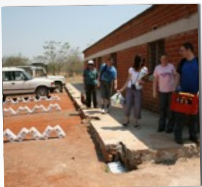
TEAM ARRIVING ON SITE

the praise. The team left Northern Ireland on the 29th of August for two weeks. On arrival in Tabora the first thing which we needed to do was to sort out our temporary assignment visas which were issued the following day. We praise the Lord for this as this was the first time we have had to do this. After