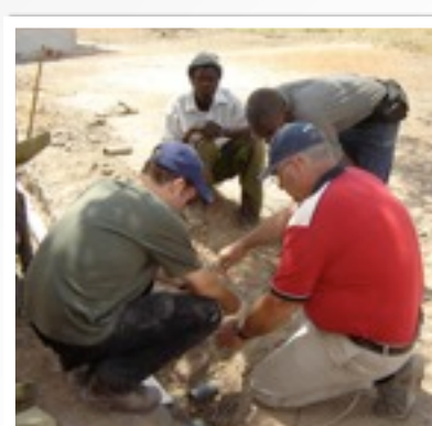
CONNECTING UNDERGROUND CABLES