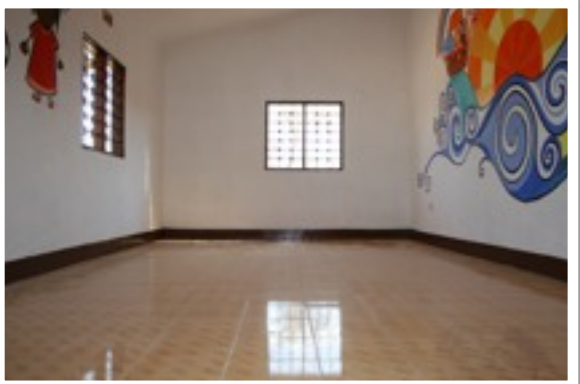
One of the finished dorms

settling in at Tim and Kim Whitfield's, it was then off for a visit to the Children's Home at Kazima. We made plans about the different things that needed to be done and the following day it was all action. The whole interior of the main building had been painted white which was a great start as the murals could now be started. The electrical work was also started as was the tiling of the floors. Work was also started on the two verandas. The kitchen units were ordered with a local carpenter. The windows and door frames were being painted. There was a lot going on at the same time. The Lord answered prayers and none of the team had any problems with their health.